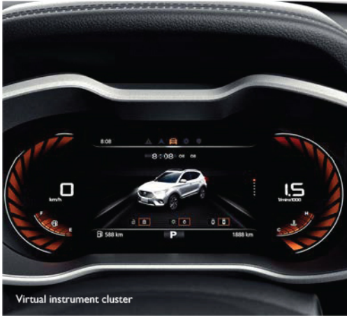
Virtual instrument cluster