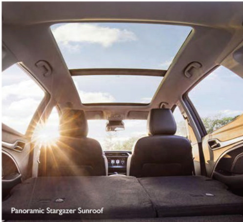
Panoramic Stargazer Sunroof