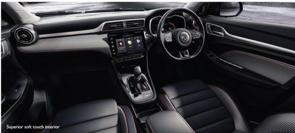
Superior soft touch interior