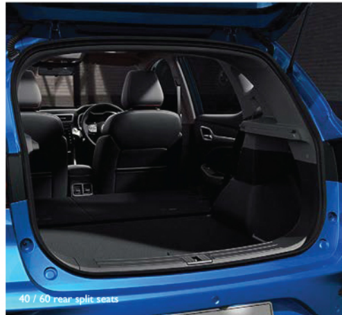
40 / 60 rear split seats