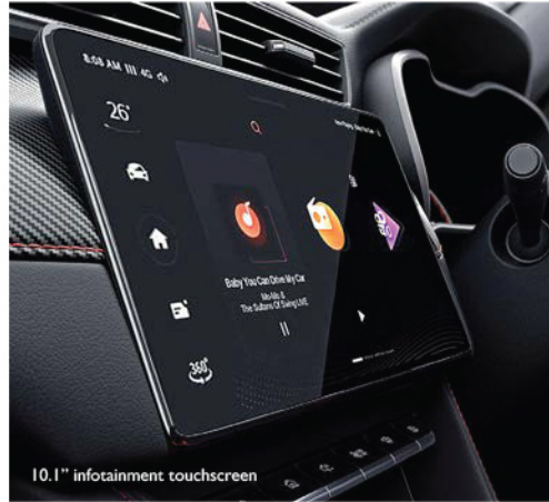
10.1" infotainment touchscreen